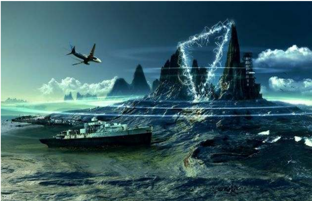
Digital painting inspired by Bermuda's Triangle supernatural theories

One of the most interesting supernatural theories is the one of time travel. This theory is based on the notion of parallel universes that are separated by time. This theory says that somehow, in the area known as the Bermuda Triangle, there is a window or door that allows transportation from one universe into another. The theory is that this transportation takes place seamlessly and without the immediate knowledge or consciousness of the individuals affected. The belief is that the individuals who have been lost in this time warp remain unchanged and do not age, and that ultimately, if they are able to cross back through time, they will be exactly the same as when they left.