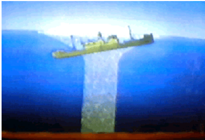
Graph that shows the instant loss of buoyancy on the methane hydrate eruption field

Publications by the USGS describe large stores of undersea hydrates worldwide, including the Blake Ridge area, off the coast of the southeastern United States. However, according to the USGS, no large releases of gas hydrates are believed to have occurred in the Bermuda Triangle for the past 15,000 years