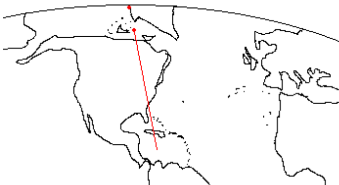
The red dots indicate True North, that is, the absolute geographic north of this planet (North Pole); and Magnetic North, 1,500 miles in a southerly direction from it

consider absolute north, is not where the compass points. Following the N on your compass is not going to The area of the Agonic Line marked in red, as it was when the Coast Guard drew up their statement 30 years ago. Along this line there is no need to adjust one's heading because Magnetic North and True North coincide. Already at Bimini island there is a 2 degree westerly variation. That means if a pilot wanted to head True West here, he would not steer 270o by his compass but 272o. It seems infinitesimal, but over time 2 degrees can lead to dozens of miles off course. In the short distances between the coast and the Bahama Islands, it doesn't amount to much here.lead you to the North Pole; it will lead you to Prince of Wales Island.