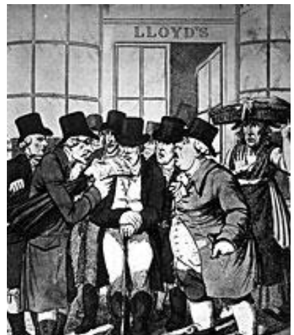
Figure 11: the famous lloyd's coffe shop