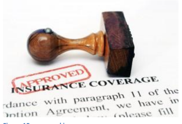
Figure 15: approved insurance

ii Companies' Policies: Combined policy form used (since 1939) for all subscribing companies; prepared by broker; policy passed to Institute of London Underwriters for checking & signing. 2 Canada: Subscription Policies (Joint Policies) used for large risks so that many companies can participate. Each underwriter accepts a proportion of the risk and each signs the policy. 3 USA: Like Canada, but signing of Subscription Policy by American Hull Insurance Syndicate.