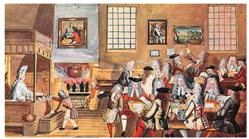
Figure 10: first step of marine insurance

The commencement of the 17th century formed the starting point of a new period in the history of marine insurance in Great Britain. During the first period, dating back to the beginnings of foreign