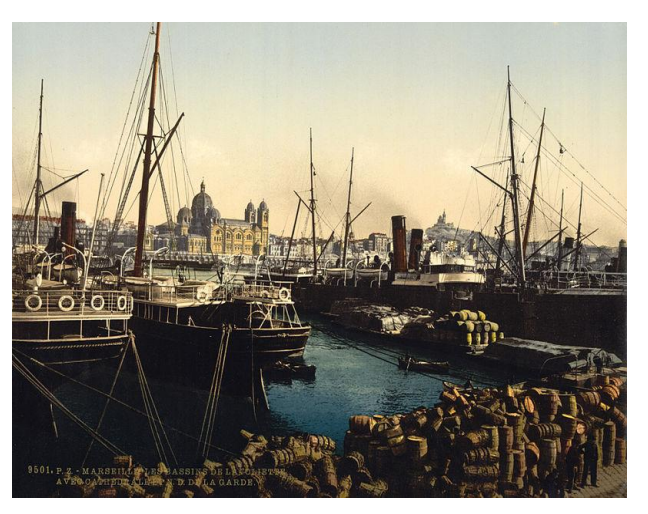
Figure 3: port of marseille

The charter party as of now would retain its exclusive character of contract of affreightment,