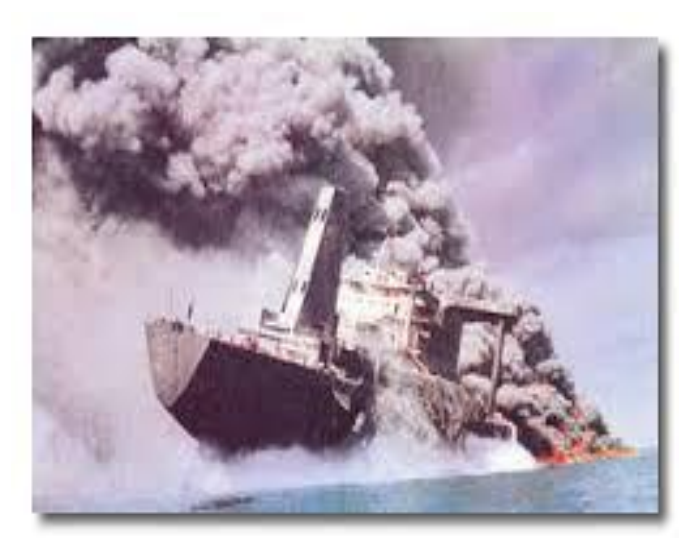
Figure 16: ship lost on fire

ii: Constructive Total Loss: Cost to repair/replace exceeds policy limit (commercial total loss). Insured may claim for a partial loss or abandon the property and claim a total loss. Property must be reasonably abandoned because actual total loss appears inevitable or to prevent total loss requires an expenditure exceeding the saved value. It is a condition precedent to a claim that the Insured unconditionally abandons his interest to the Insurer. Insurer is entitled to take over the property if desired.