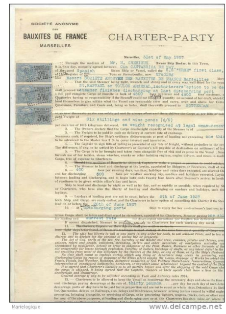
Figure 1: middle-age charter party

The end of the middle ages characterizes itself by a considerable development of the shipping industry. Each harbor has its own customs and uses and different maritime cities already have ordinances in which provisions appear concerning chartering. The customs of some cities and more specifically, the edicts of the Italian and Mediterranean cities have extended themselves very fast to other areas. The legislative provisions from that time, which left their