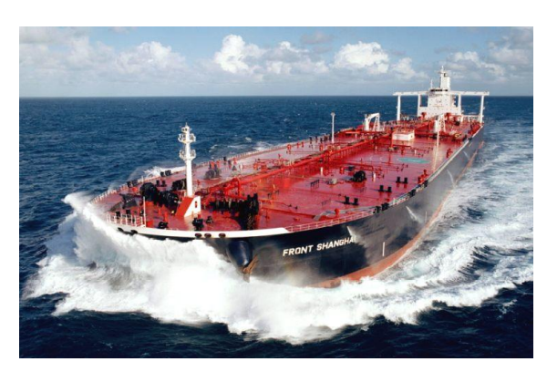
Figure 12: state of the art tanker ship

had no interest. This was the first attempt to put an end to the practice of wagering disguised by marine policies whereby persons without interest in a vessel or its cargo would insure using a marine policy form. The 1745 Act required those procuring marine policies to be interested in the subject-matter, and similarly prohibited the practice of insuring on the basis of "policy proof of interest". The Act of 1788 laid down that all policies made out in blank, were void and the Act of 1795, required all policies of marine insurance to be in writing and to be stamped. In 1894 'The Marine Insurance Codification Bill' was introduced in the House of Lords, by Lord Herschell, and it is its content - slightly altered - which provided the basis for the 1906 Act,