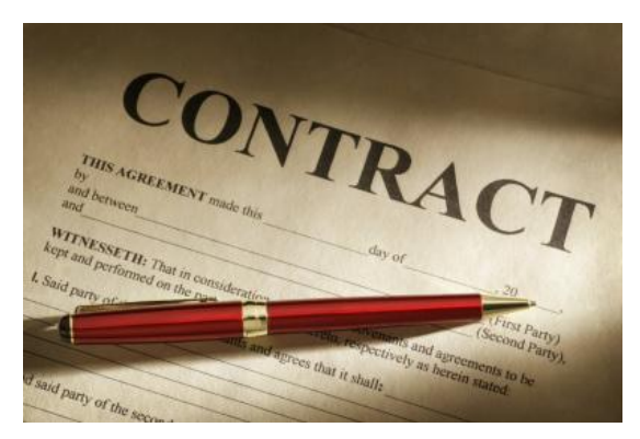
Figure 5: typical contract

In fact, the bill of lading does not replace the contract of affreightment but it is legally accepted as the confirmation and the realization of the contract of affreightment. Nearly no legislation gives a clear definition of the bill of lading. Some local legislation refers to it as a receipt for the goods which the Master takes in charge. Article 1 of the new "Rules of Hamburg" which were accepted at the Diplomatic Conference of Hamburg in March 1978 gives of the bill of lading the following definition: