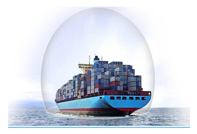
Figure 8: "protected" ship

Marine insurance plays an important role in the s hipping industry and in shipping law. Most shipowners carry hull insuranceon the ir ships and protect themselves against claims by third parties by purchasing "pr otection and indemnity" insurance. Cargo is usual ly insured against the perils of the sea, which are defined as natural accidents peculiar to the sea. Forexample, storms , waves, and all types of actions caused by wind and water are classified as perils of the sea. If ashipowner or cargo owner wishes t o be protected against losses incurred from war, t