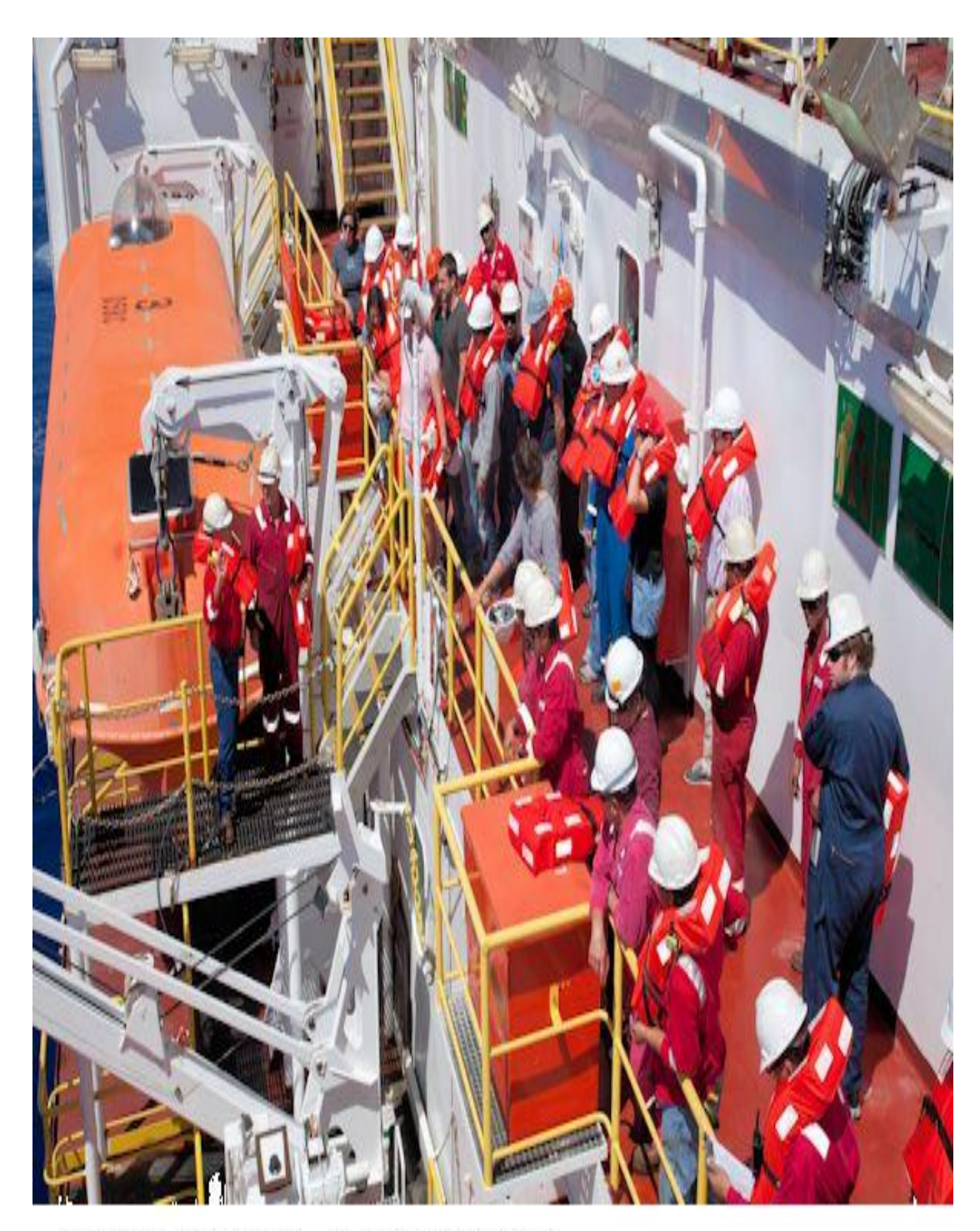
Abandon Ship Drill