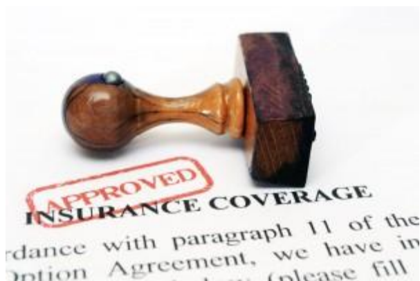
Figure 15: approved insurance

3 USA: Like Canada, but signing of Subscription Policy by American Hull Insurance Syndicate.