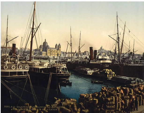
Figure 3: port of marseille

The charter party as of now would retain its exclusive character of contract of affreightment,