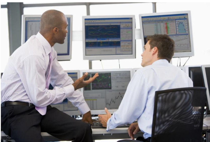
Figure 7: shipbroker office

Generally it is neither the Ship Owner nor the Charterer who establishes the charter party and signs it, but their representative, viz. the transport broker. The tasks of the transport broker are exhaustively described in the paragraph Transport Broker. It is hereby important that the transport broker can act as Shipbroker or as chartering broker, or as cargo broker and that he only acts as agent provided that his signature is followed by the reservation "as agent only" without naming the parties concerned or "as agent for X". In the first case this can sometimes lead to