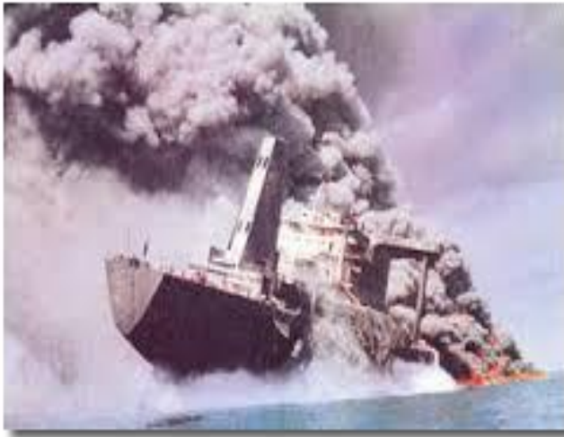
Figure 16: ship lost on fire

ii: Constructive Total Loss: Cost to repair/replace exceeds policy limit (commercial total loss). Insured may claim for a partial loss or abandon the property and claim a total loss. Property must be reasonably abandoned because actual total loss appears inevitable or to prevent total loss requires an expenditure exceeding the saved value. It is a condition precedent to a claim that the Insured unconditionally abandons his interest to the Insurer. Insurer is entitled to take over the property if desired.