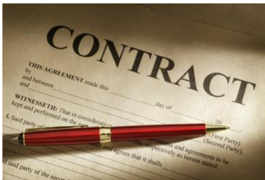
Figure 5: typical contract

In fact, the bill of lading does not replace the contract of affreightment but it is legally accepted as the confirmation and the realization of the contract of affreightment. Nearly no legislation gives a clear definition of the bill of lading. Some local legislation refers to it as a receipt for the goods which the Master takes in charge. Article 1 of the new “Rules of Hamburg” which were accepted at the Diplomatic Conference of Hamburg in March 1978 gives of the bill of lading the following definition: