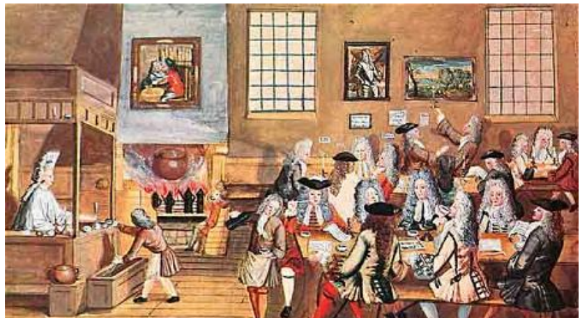
Figure 10: first step of marine insurance

The commencement of the 17th century formed the starting point of a new period in the history of marine insurance in Great Britain. During the first period, dating back to the beginnings of foreign