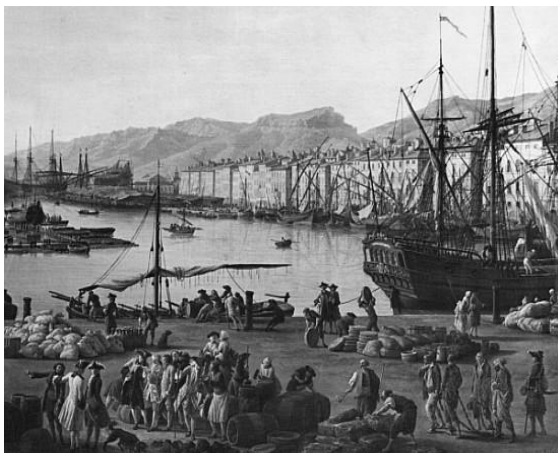
Figure 2: painting of a port

largest marks on the maritime ocean carriage.