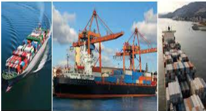
Figure 13: container ship operations