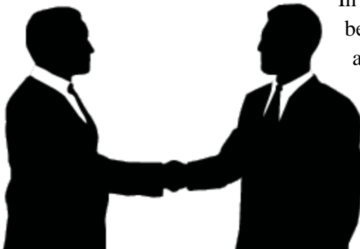
Figure 6: agreement between two parties

The parties which are involved in a contract of affreightment, are: the Owner, i.e. the person who lets the ship and receives the freight and the Charterer, i.e. the person who hires the ship and must pay the freight.