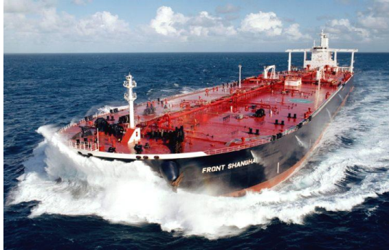
Figure 12: state of the art tanker ship

had no interest. This was the first attempt to put an end to the practice of wagering disguised by marine policies whereby persons without interest in a vessel or its cargo would insure using a marine policy form. The 1745 Act required those procuring marine policies to be interested in the subject-matter, and similarly prohibited the practice of insuring on the basis of “policy proof of interest”. The Act of 1788 laid down that all policies made out in blank, were void and the Act of 1795, required all policies of marine insurance to be in writing and to be stamped. In 1894 ‘ The Marine Insurance Codification Bill ’ was introduced in the House of Lords, by Lord Herschell, and it is its content - slightly altered - which provided the basis for the 1906 Act,