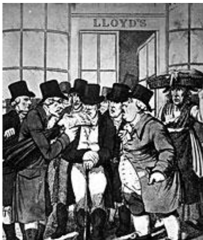
Figure 11: the famous Lloyd's coffee shop