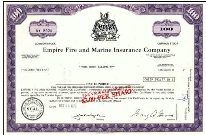
Figure 14: sample of marine insurance