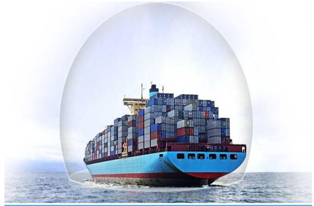
Figure 8: "protected" ship

Marine insurance plays an important role in the shipping industry and in shipping law. Most shipowners carry hull insurance on their ships and protect themselves against claims by third parties by purchasing "protection and indemnity" insurance. Cargo is usually insured against the perils of the sea, which are defined as natural accidents peculiar to the sea. For example, storms, waves, and all types of actions caused by wind and water are classified as perils of the sea. If a shipowner or cargo owner wishes to be protected against losses incurred from war, the owner must purchase separate war-risk insurance or pay an additional premium to include war-risk in the basic policy.